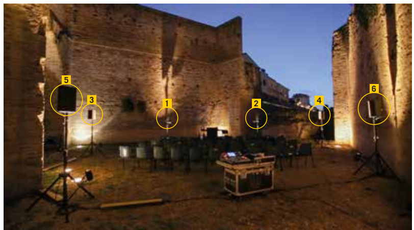
The arrangement of the live hexaphonic system.